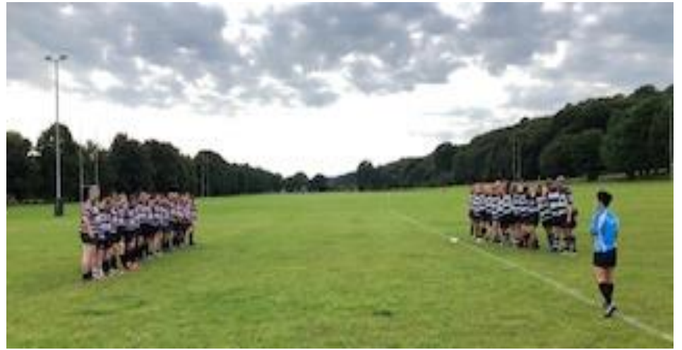
Beccs Derby Day